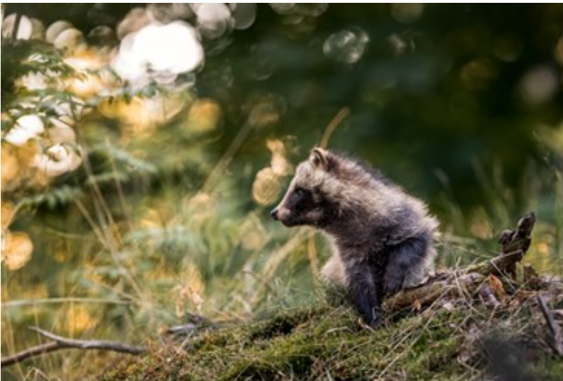
Raccoon dog (80 x 60 cm)

After seven nights of trying I finally managed to capture a badger. Espoo, 2020