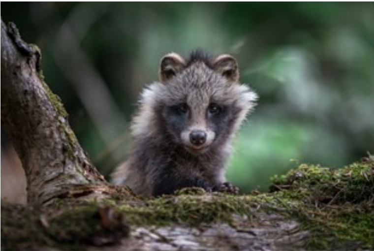
Raccoon dog (30 x 20 cm)

This young fox had just left its family and is preparing for the first winter of its life. Helsinki, 2017