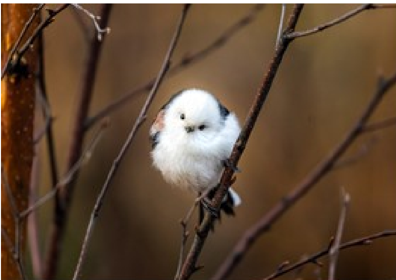
Long-tailed tit (30 x 20 cm) In my opinion the cutest bird in Finland. Espoo, 2019