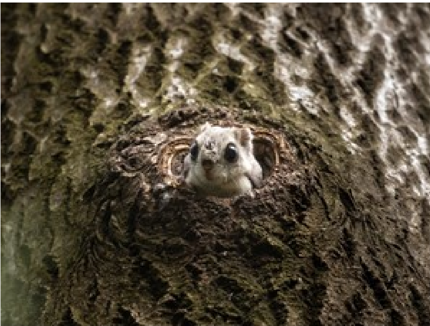
Siberian flying squirrel (30 x 20 cm)

Red squirrel running around searching for food. Helsinki, 2019