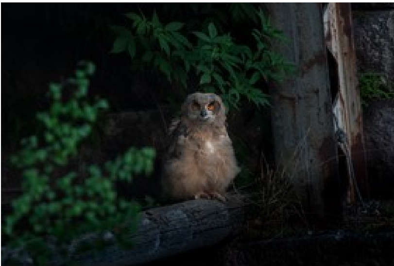
Eurasian eagle-owl (30 x 20 cm) A few weeks old Eagle-owl near on its nesting area. Helsinki, 2018