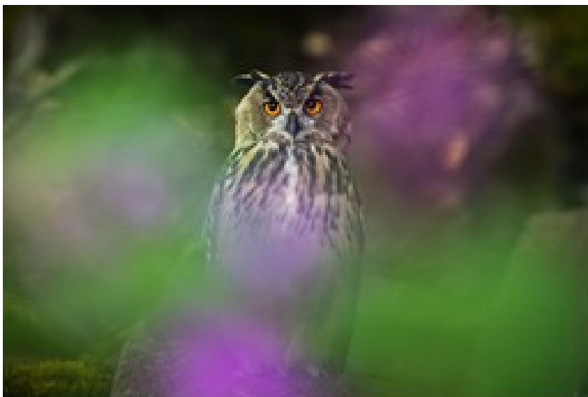
Eurasian eagle-owl (30 x 20 cm) The biggest owl species of Europe. Helsinki, 2018