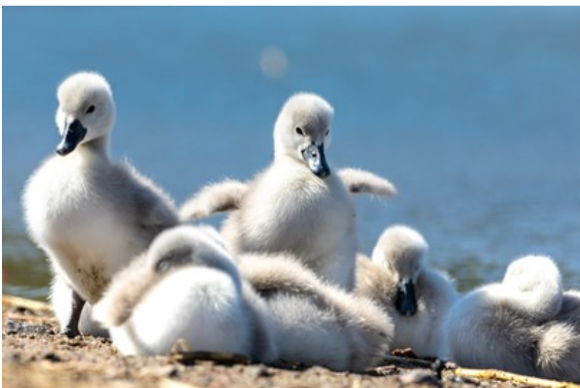
Mute swan (30 x 20 cm)

Young fox siblings keeping each other's fur clean by licking it.