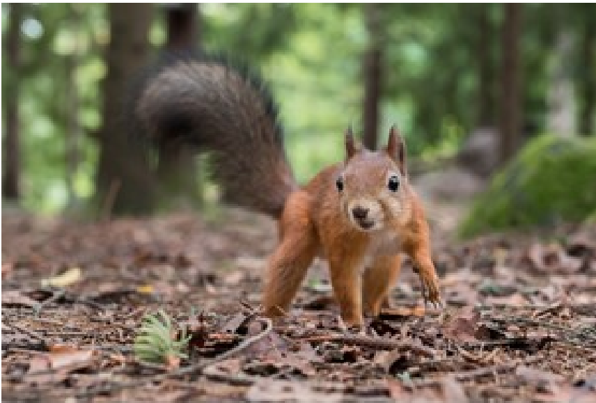
Red squirrel (80 x 60 cm)

Red squirrel running around searching for food. Helsinki, 2019