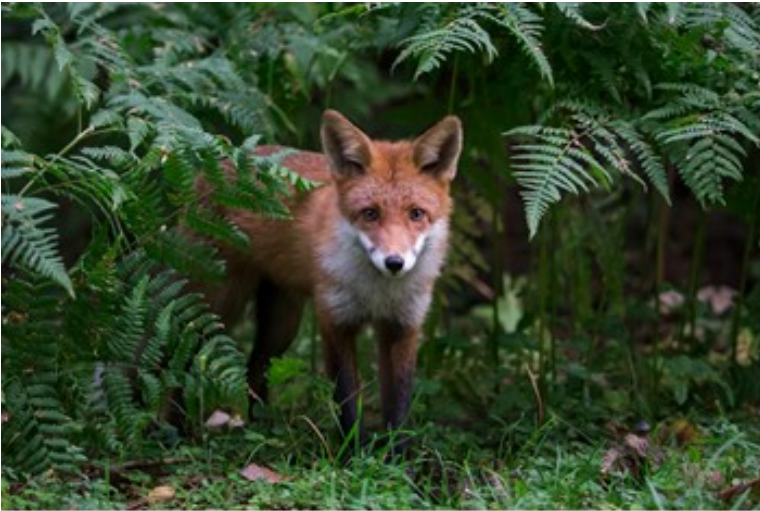
Red fox (30 x 20 cm)

This young fox had just left its family and is preparing for the first winter of its life. Helsinki, 2017