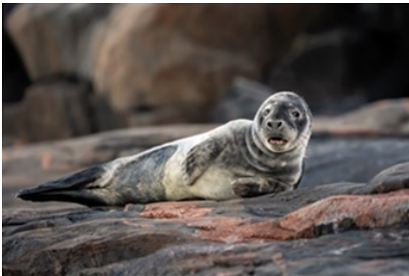
Grey seal (30 x 20 cm) Young seal resting on the coastline of Helsinki city. Helsinki, 2020