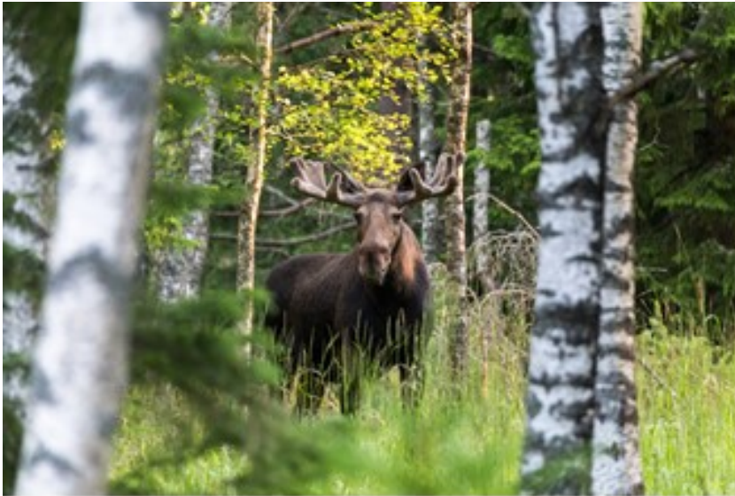
Moose (80 x 60 cm) Male moose with growing antlers. Kirkkonummi, 2017