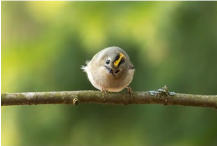
Goldcrest (30 x 20 cm)

The smallest, and probably grumpiest looking, bird in Europe.