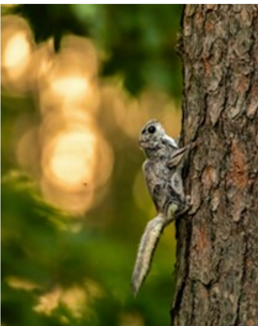
Siberian flying squirrel (80 x 60 cm)

Young raccoon dog posing for camera. Helsinki, 2018