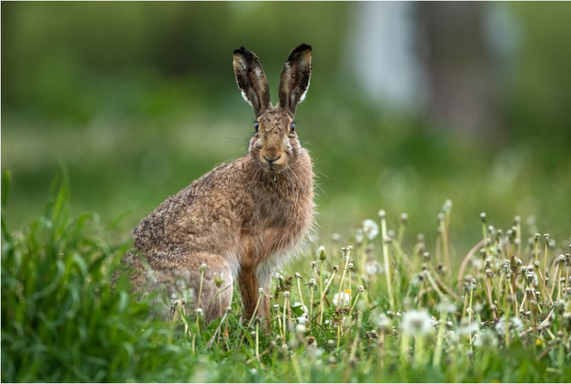
European hare (30 x 20 cm) Hares love eating dandelions. Espoo, 2020