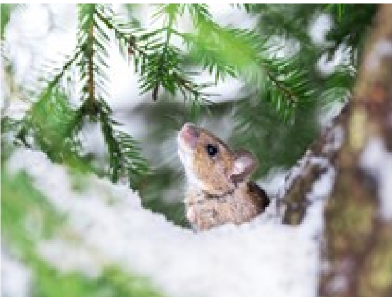
Yellow-necked mouse (80 x 60 cm)

Young raccoon dog cub at sunset. Helsinki, 2018