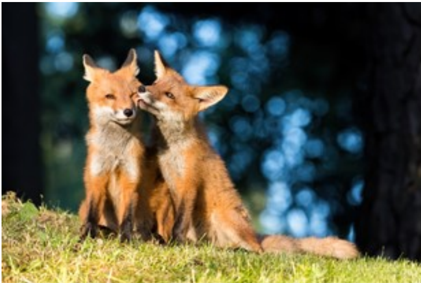
Red fox (30 x 20 cm)

The smallest, and probably grumpiest looking, bird in Europe.