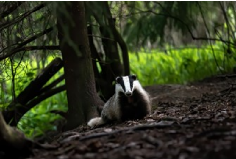
European badger 80 x 60 cm)

After seven nights of trying I finally managed to capture a badger. Espoo, 2020