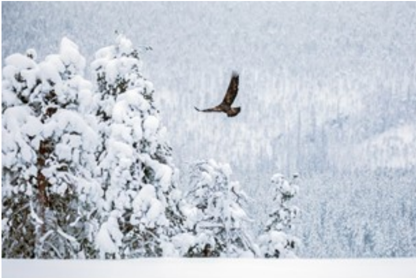
Golden eagle (80 x 60 cm)

Golden eagle flying over Oulanka National Park. Kuusamo, 2018